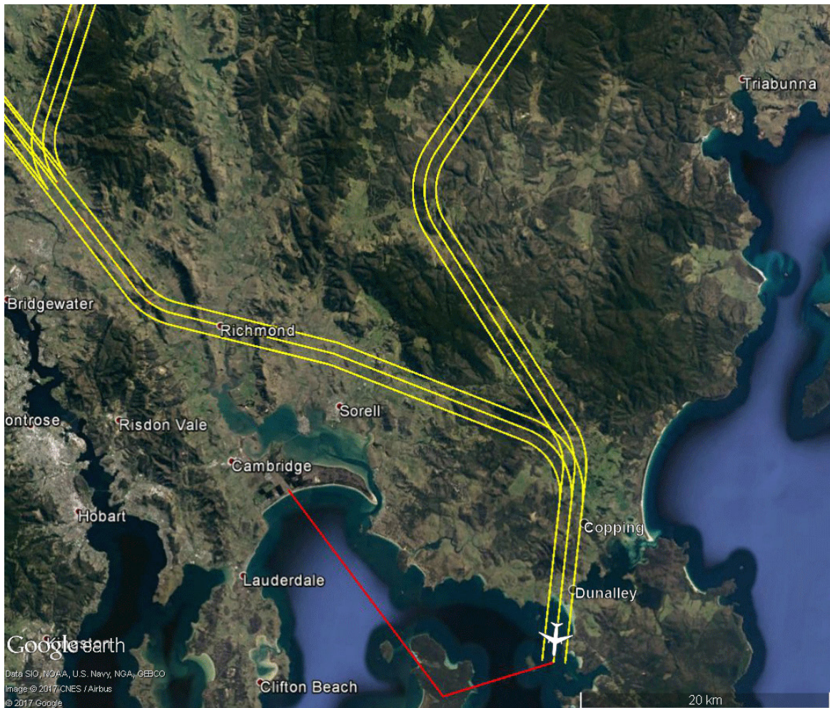
Figure 4: New flight path show in yellow for aircraft arriving to Runway 30 from the north. No change to existing flight path shown in red (instrument approach).

Residents in the Dunalley and Copping will notice changes to the tracking of arriving aircraft and an increase in the consistency of this tracking. Aircraft are expected to be at altitudes of approximately 5000 to 6000 feet over these areas.