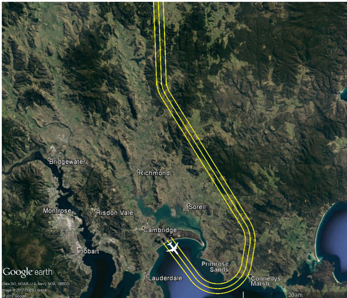
Figure 1: New flight path for aircraft departing from Runway 12 to the north

Residents of Primrose Sands are not likely to be directly overflown however they may notice changes to the tracking of departing aircraft and an increase in the consistency of this tracking.