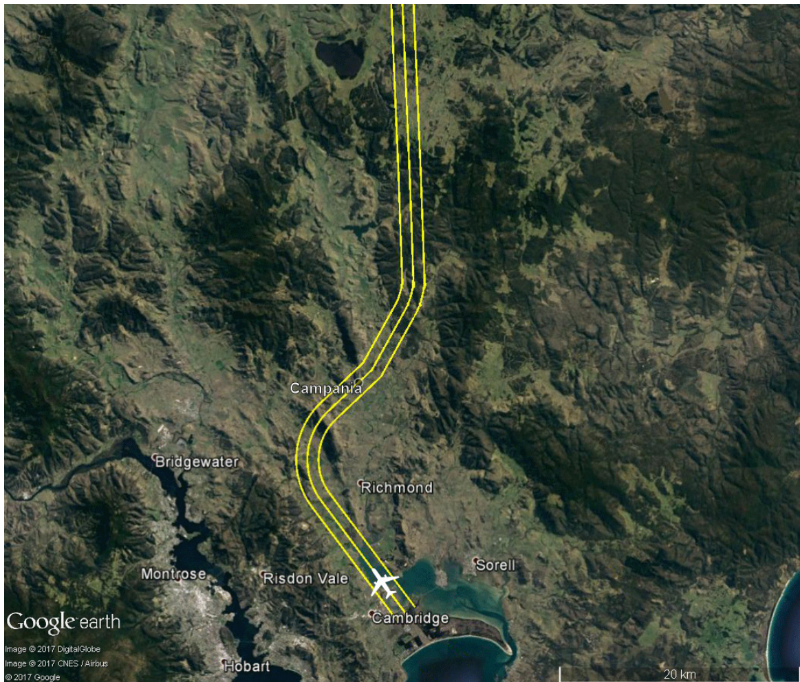
Figure 3: New flight path for aircraft departing from Runway 30 to the north.

Residents in the Campania area are currently overflown, however they may notice changes to the tracking of departing aircraft and an increase in the consistency of this tracking. Aircraft will be at altitudes of approximately 4000 to 5200 feet over this area.